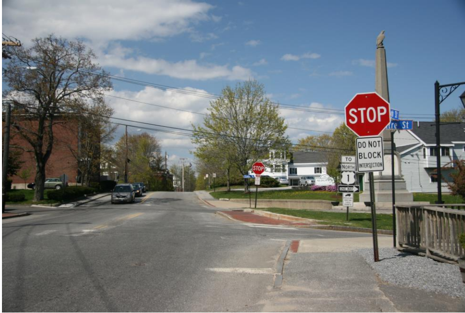
Looking northbound at the intersection of High Street and Centre Street, one must turn right to go downtown, however, nothing instructs motorists where to turn.

A tourist or first-time visitor to Bath who elects to exit via High Street must turn right onto Centre Street in order to access Downtown, however, the signage does not instruct them to turn. From this vantage point, downtown is only partially visible. At peak traffic hours one's focus must be on navigating the busy intersection, decreasing awareness and time for decision making.