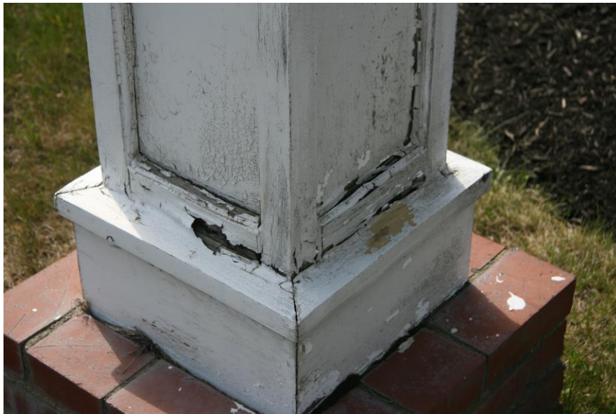
Many of the large downtown wayfinding signs are significantly deteriorating.